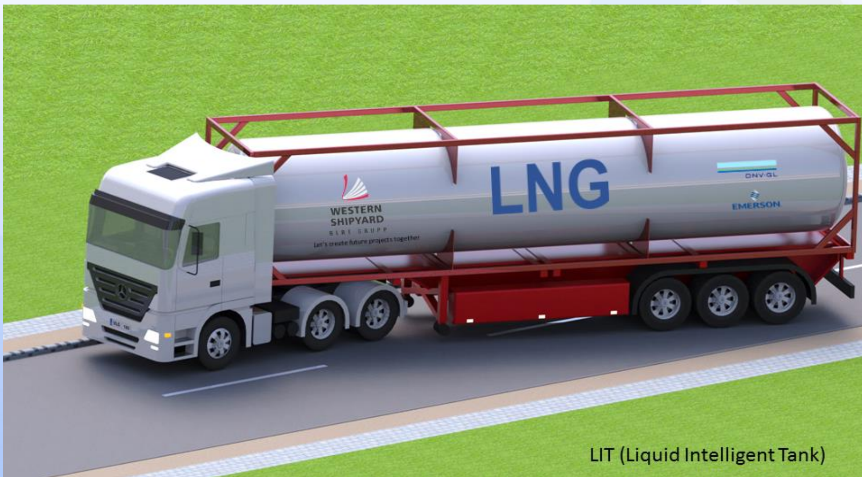
LIT (Liquid Intelligent Tank)