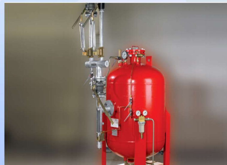
Dry powder system